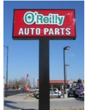
In-Appropriate: Pillar Signage

33) Temporary Sign – A sign which is not intended to be used for a period of time exceeding 30 days and is not attached to a building, structure, or ground in a permanent manner. Such signs usually being constructed of poster board, cardboard, engineered lumber (Masonite), plywood, or plastic material and mounted to wood, metal, wire or rope frames or supports.