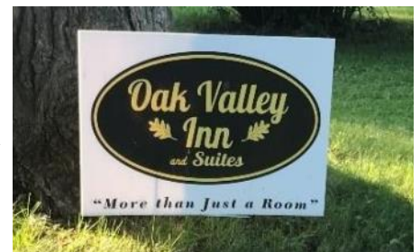
Appropriate: Lawn Sign

19) Lawn Sign – A sign constructed of materials not intended for permanent installation that are attached to a single or multiple posts for support and stuck into the ground. The height of a lawn sign shall include any posts or supports. Political campaigns, garage sales, and charitable events, for example, are often advertised with lawn signs.