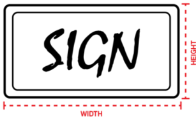
Figure 1: Single Sign Face Area