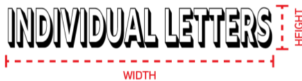
Figure 2: Individual Letter Sign Area