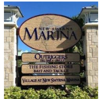
Appropriate: Pillar Signage