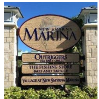
Appropriate: Pillar Signage