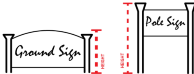
Figure 3: Freestanding Sign Height