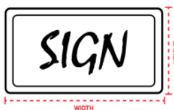
Figure 1: Single Sign