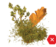
No Yard Waste