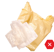
No Loose Plastic Bags, Recyclables in Plastic Bags, or Film Empty recyclables directly into your cart