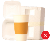
No Foam Cups & Containers