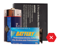
No Hazardous Waste or Batteries