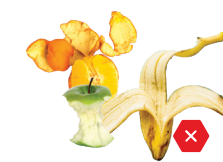
No Food or Liquids